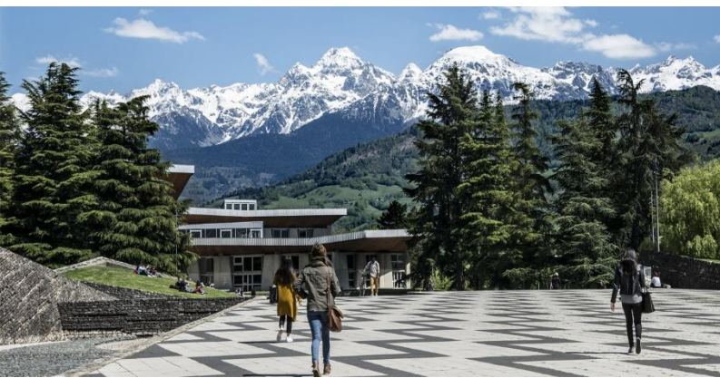
CAMPUS DE GRENOBLE