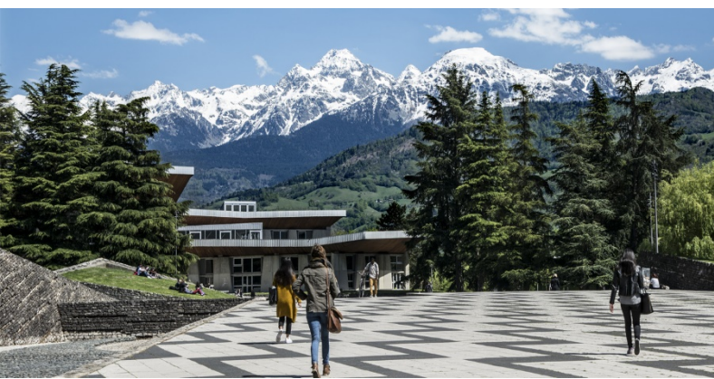
CAMPUS DE GRENOBLE