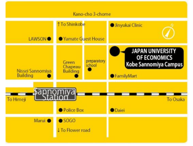
4-4-7 Kotonoo-machi Chuo-ku, Kobe 651-0094 JAPAN

Kobe, a tourism center in the Kansai region, is a port city that has since long ago been a thriving center for trade. In Sannomiya, in the center of Kobe, a variety of cultures have mixed together and produced a tangible international flavor for both trade and tourism. Come and study business in the international city of Kobe.