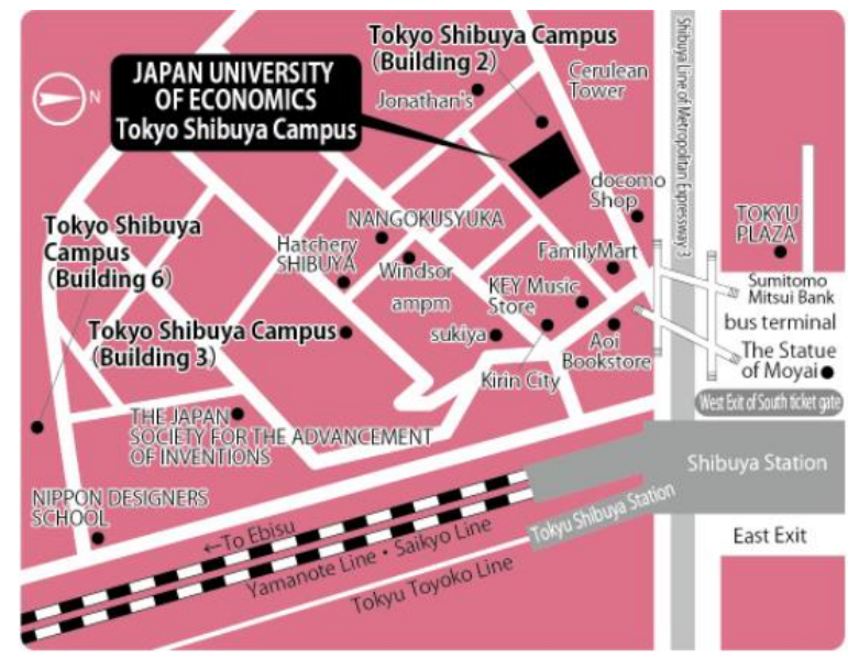
24-5 Sakuragaoka, Shibuya-ku, Tokyo 150-0031 JAPAN

Tokyo's Shibuya has attracted keen attention from around the world throughout history. Fashion of course but also cutting edge businesses are concentrated here, and information is transmitted hence throughout the world. Studying in the world's most stimulating environment, Shibuya Campus will be a valuable experience throughout students' lives and careers.